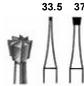
CARBIDE - Inverted Cone Small, Medium, Long, Large - For shaping and texturing in wood, and engraving metal. Also good for bulk reduction in most materials.