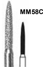
MM58 - Diamond Flame Point, Coarse Used for contouring and fine shaping in hard or soft materials.