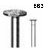
Diamond Wheels Two sizes - Used to carve straight, flat bottom grooves and for sectioning.