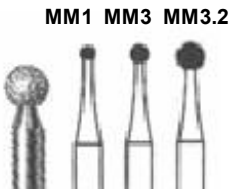
Round Diamond Small, Medium, & Large, Best bur for engraving and stippling in glass. Also used to shape and contour softer materials.